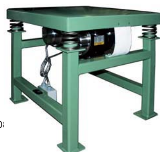
VT 7/8 with 2 NEG 50770 electric