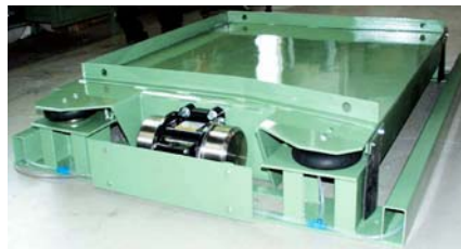
VTH/W 12/12 with 2 NEG 501510 for a weighing machine

NetterVibration offers the accessories required for the mounting, installation and control of vibrators and vibrating tables.