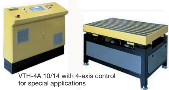
VTH-4A 10/14 with 4-axis control for special applications

In individual cases, the required drive can only be determined by means of testing. We provide free test devices (excl. transport costs) for this purpose.