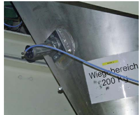
Cleaning weighing containers