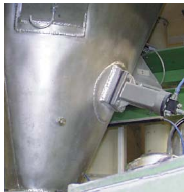
Cleaning bunker walls