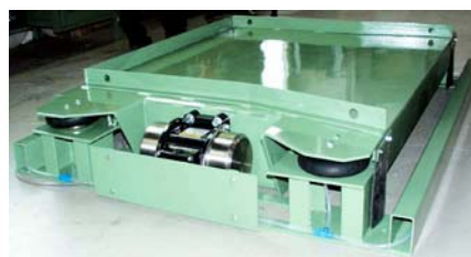
VTH/W 12/12 with 2 NEG 501510 for a weighing machine

NetterVibration offers the accessories required for the mounting, installation, control and monitoring of vibrators and impactors.