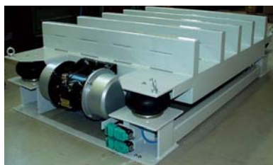
VTF/R 10/12 with 2 NEG 251370 E for applications conforming to ATEX