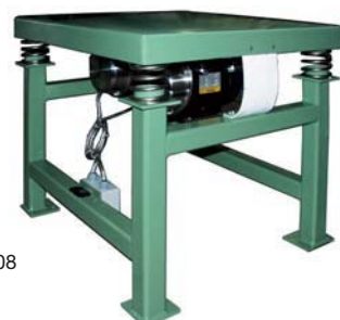
VT 7/8 with 2 NEG 50770 electric