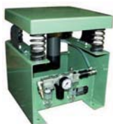
VTP 3/3 with NTS 350 NF pneumatic