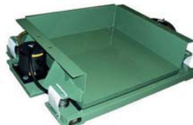
VTF 8/8 with 2 NTS 50/08 flat design