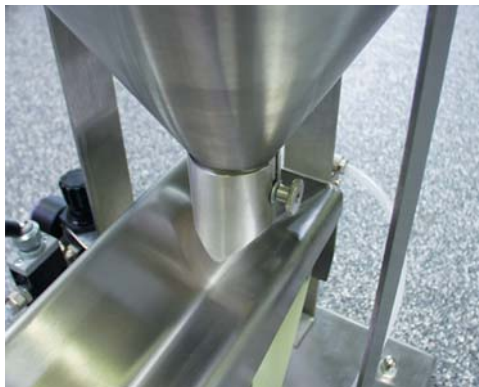
Dosing port at the silo outlet